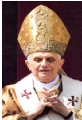
BENEDICT AT THE WALL

The king said there is consensus in the international community that there is no alternative to the two-state solution .