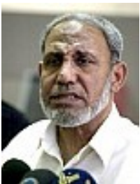
Hamas' Mahmoud a-Zahar

March 3/09. DEBKAF ile 's counter-terror sources that Gaza's Hamas strongman Mahmoud A-Zahar was given an Israeli safe passage to travel from Gaza to Cairo in mid-February.