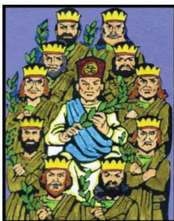
BEAST & 10 HORNS

Now what about the ten horns? It is clear that they are ten kings — future kings.