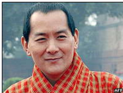
KING JIGME SINGYE WANGCHUK

Bhutan is becoming increasingly known for its pure practice of Mahayana Buddhism in the Tantric form, its untouched culture, its pristine ecology and wildlife, and the unparalleled scenic beauty of its majestic peaks and lush valleys. Bhutan is a land of dzongs (fortresses) and monasteries.