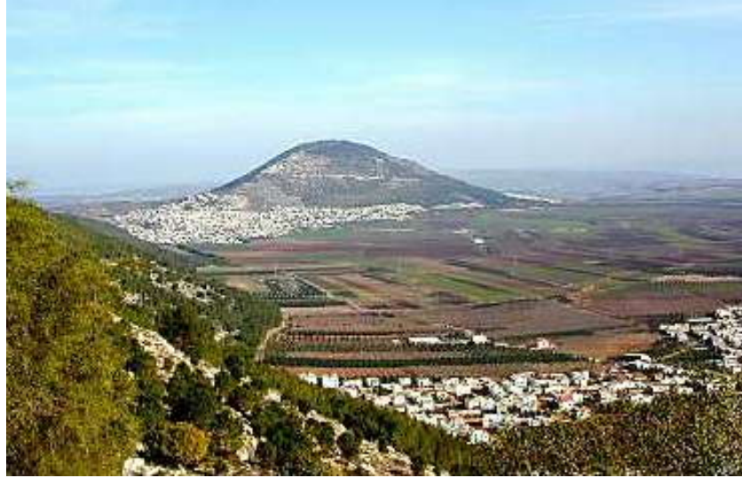
MT TABOR IN N. ISRAEL, BELIEVED TO BE THE MOUNT WHERE THE TRANSFIGURATION TOOK PLACE

His disciples asked Him, “Why then do the scribes say that Elijah must come first?” Y’shua answered, “Elijah is coming and will restore all things; but I tell you, that Elijah has already come, and they did not recognize him, but did to him whatever they wished. So also the Son of Man is going to suffer at their hands.” Then the disciples understood that He had spoken to them about John the Baptist.